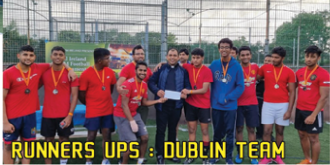
RUNNERS UPS : DUBLIN TEAM