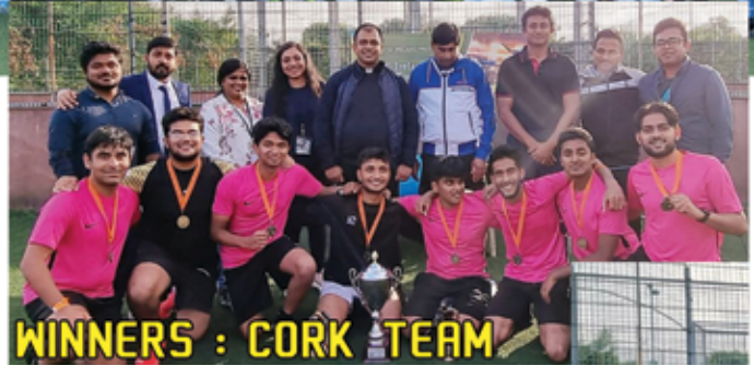
WINNERS : CORK TEAM